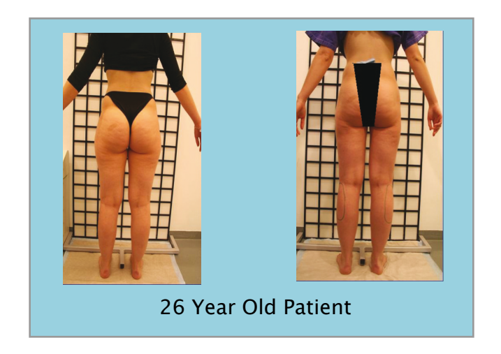
Fig. 5a: Before WAL liposuction

Long-term studies were designed to ascertain if there was a normalization of the distribution of pressure on the feet of lipedema patients after the surgical removal of the inner thigh lipedema fat.