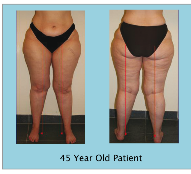
Fig. 1: Leg axes misalignment in a lipedema patient

Besides CT (12), an MRI can also help to determine the location as well as the extent of the lipedemic fat distribution. Sonography has proved successful to depict the subcutaneous fat tissue (5). The thickness layer and increased echogenicity of the lipedema fat tissue allow it to be differentiated from normal subcutaneous fat. In addition, compression sonography can help to evaluate the remaining compressibility to determine the stage of the disease, and can enable the clinician to judge the degree of pain. Furthermore, to clarify possible coexisting lymphedema, an indirect lymphangiography can be used, as well as a functional lymphoscintigraphy to evaluate the lymphatic drainage.