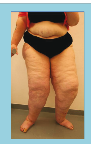
Fig. 3: Lipedema progression led to incorrect loading, resulting in massive joint degeneration in a 39 year old patient.

The abnormal accumulations of fat on the legs, especially those on the proximal inside of the thighs, cause affected patients develop a characteristic gait pattern (14). To avoid chafing of the skin, especially in the warmer months, patients tend to abduct their legs while walking, resulting in their being held in an upside-down V-position. These changes can manifest long before the diagnosis of lipedema is made. The patients only notice the increase in circumference of the legs, and believe that the joint pain they feel is due to to the accompanying weight gain. As this fat continues to accumulate, the abduction of the legs becomes wider, and the misaligned joint axes become clinically relevant. The improper stress in abduction causes a valgus deformity in the knee joints, and later a "skew-foot" position of the ankle joint and an apparent varus shift of the hip joint. This pseudo coxa-vara position, caused by the abduction of the legs, causes the typical "duck walk" of lipedema patients. This malposition of the joints occurs even in lipedema patients of normal weight. Knock-knees appear in obese patients as well, but in contrast to the malpositioning caused by lipedema, knock-knees due to obesity are accompanied by a valgus position of the hip joint.